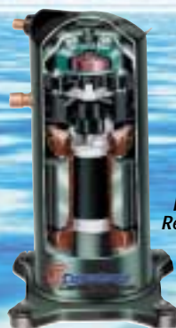
Refrigerant Receiver Tank

• Scroll™ Compressor The Most Efficient Compressor Available Equipped With A Exclusive Refrigerant Receiver Tank