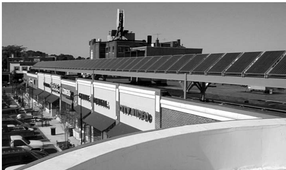
This 20-kilowatt PV system produces electricity for the common areas of a shopping center in Cambridge, Massachusetts.