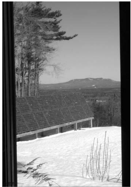
A home in the woods of New Hampshire had too much shade to use PV on the roof. The solution was installing a freestanding PV array.

It might not be. You generally get what you pay for, and it's possible that a low price could be a sign of inexperience. Companies that plan to stay in business must charge enough for their products and services to cover their costs, plus a fair profit margin. Therefore, price should not be the only consideration, and quality should probably rank high on the list.